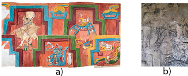
Figure 1: a) watercolour by Adela Breton, panels 6 to 11 of the Acancéh frieze. b) surviving part of the frieze, photo taken by Sue Giles in 2019

traveled to the newly discovered site and spent 5 weeks in 1907 copying the frieze of the Palace of the Stucco [12]. She traced it on drafting linen, also known as drafting cloth. This material was used for technical drawings from the end of the 19 th century until the middle of the 20 th century and is highly starched and calendered cotton or linen fiber. In 1908 Adela Breton published a short article in which she presented the watercolour reproductions she had made of the building wall paintings. Adela proceeded to identify each of the motifs and characters that make up the frieze, but she did not venture to propose any interpretation, hoping that subsequent excavations would reveal other portions of the frieze on the remaining facades of the building. Her watercolours remained unpublished in the City of Bristol Museum, England until 1991, the year in which Virginia E. Miller published them in their entirety together with his iconographic interpretation of both the frieze and of the wall paintings [10]. In 1907, Edouard Seler visited Acancéh too and documented the frieze in the state it was found in, using an ink drawing and photographs by Wilhelm von den Steinen. In 2000 Wolfgang Voss N et al presented a comprehensive report to the “Proyecto Arqueológico Acancéh” directed by the National Institute of Anthropology and History where they explain what is known so far about the symbolism linked to the characters depicted in the frieze [13].