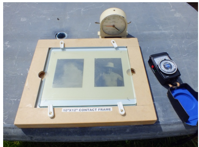
Figure 2: Positives mounted in a contact frame for exposure.

To make the photogravure plates the colour separated files were printed in greyscale on transparent inkjet film. For the printing plates, we used Toyobo Printight KF95 plates. These plates consist of a photosensitive polymer film mounted on a transparent polyester film. The KF95 has a maximal relief depth of 0.65 mm. The plate cures when exposed to light between 300 and 400 nm [15]. Because of the lockdown we had to use the UV fraction of sunlight as our UV source. The plates were exposed between 12:00 and 14:00 BST to exploit the maximum UV index and keep exposure times manageable. Photogravure plates were made by first exposing the photosensitive film through the so-called screen for 45 sec with a UV intensity of about 5 \text{ mW}/\text{cm}^2 followed by 80 sec exposure through each of the three colour separated greyscale films (see Figure 2). The screen provides the halftone dot by generating dimples in the plate which are close under the transparent parts of the positives and stay open under their opaque parts. The plate was then developed by washing it in water of 20° C with a sponge for 3 min. After drying the plate was hardened for another 15 min in sunlight.