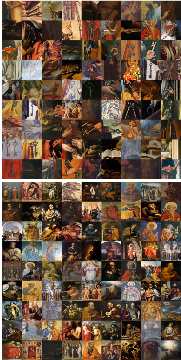
Figure 2. (L) Images of the attribute of keys culled from Western artwork from the 13th through 18th centuries, used for learning of Saint Peter’s attribute. (R) Images of Saint Peter, most of which include his attribute.

Figure 3 shows the analysis by our trained system on Andrea Verrocchio’s Baptism of Christ . The left