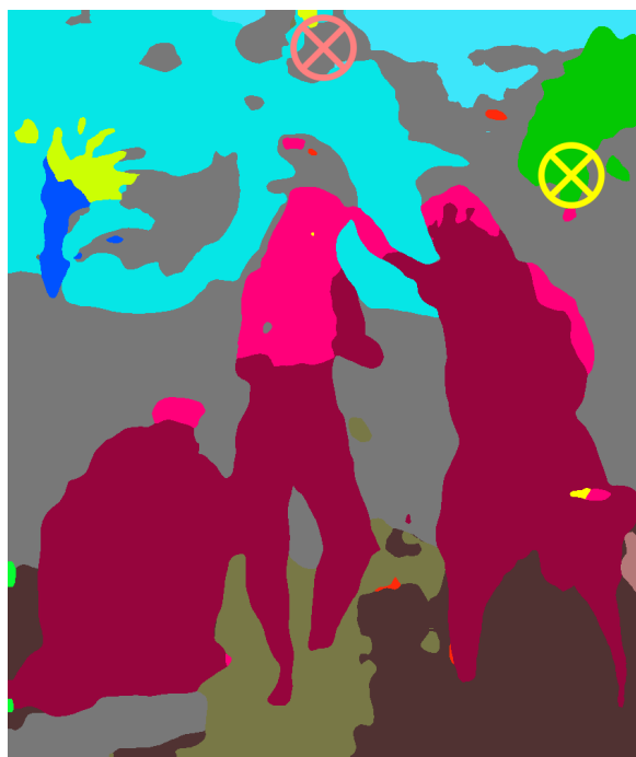
Figure 3. (L) Andrea Verrocchio’s Baptism of Christ (177 × 151 cm) oil on wood (1475), Uffizi Gallery, Florence, and bounding boxes of saints’ attributes found automatically. Here, the dove and cross are each found with a confidence of 99%. (R) The semantic segmentation where the pink and crimson indicate ANIMAL and PERSON, which jointly define the figures. The proximity of the attributes to the figures properly identify the central figure as Christ and the figure at the right as Saint John the Baptist, the correct reading of this work. Notice the presence of unphysical items, such as halos and golden rays emanating from above.