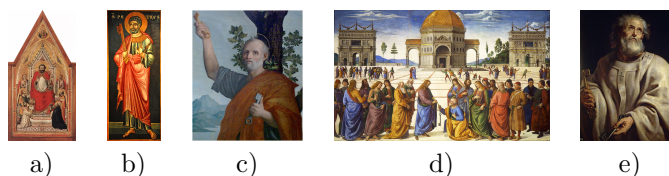
Figure 1. a) Unknown artist’s Stefani Triptych, Saint Peter enthroned (c. 1330), b) unknown artist’s Saint Peter , Convent of Saint Mary, Zadar (12th century), c) Girolamo Dai Libri’s Saint Peter with keys (1533), d) Perugino’s Delivery of the keys to Saint Peter , Vatican (1482), and e) Peter Paul Rubens’ Saint Peter (c. 1611). In works such as these, Saint Peter is recognized by the presence of his attribute, keys.

Some religious actors have several attributes (Saint Peter: keys, boat, and fish), and several actors share the same attribute (Christ and John the Baptist: cross), though which of multiple attributes is represented depends upon the settings, context, or episode being depicted. Such symbols and attributes were widely used in religious paintings, altarpieces, stained-glass windows, prayer books, and so on, to help teach and reinforce Biblical stories, particularly to illiterate parishioners. 4