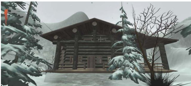
Figure 2. An initial orientation for new players is provided in the Tutorial Cabin.

Players are initially immersed in a virtual wintry setting where they glide through snowy paths and trails while experiencing action-packed encounters. The journey takes the player from a cozy cabin (Figure 2), out to a snowy landscape, and up a perilous mountain while constantly facing them with barriers and enemies that they have to contend with to get through.