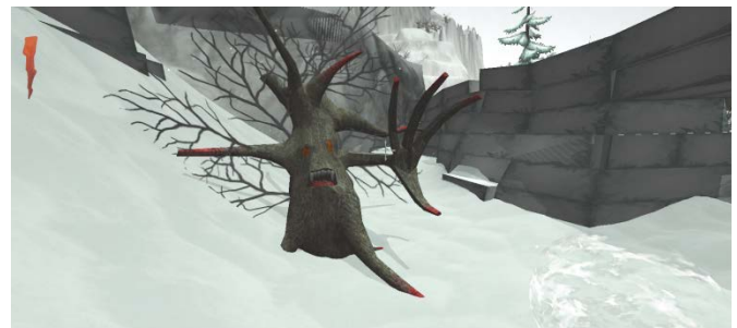
Figure 4. Neuron Trees. Because these dysfunctional, tree-like monsters blend into the landscape, players must continually look out for them throughout the game.

Neuron Trees have menacing expressions and require sedation for the player to successfully escape. They lumber toward or slowly "chase" the player and will damage the player's Health Points (HP) if they make contact. Neuron Trees also serve as a key mode of cognitive distraction as they coerce the player into taking defensive actions against them in a strategic and time-sensitive manner. They appear in multiple areas throughout the player's path in differing numbers, positioning, and even ambush methods.