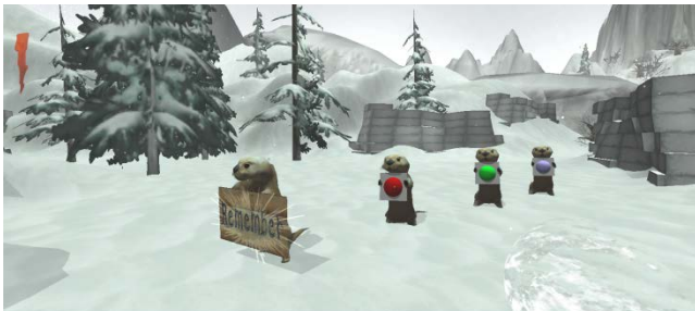
Figure 5. Otters greeting and offering instructions to players in Mobius Floe .

Sea Otters (Figure 5) are characters that also wander the game space and can interact with the player. The trickster-like and helpful Otters were implemented to represent help and concern from the players' family and friends, as well as encourage play. Unlike Neuron Trees, they are friendly entities in the game, and approach the player on sight. The patient can toss sea urchins to the Otters in much the same way they fire analgesics at the Neuron Trees. Otters that receive sea urchins will point or drop bonus items such as health packs.