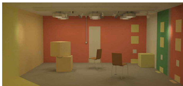
Figure 1. Digital room-model. The light areas were painted in NCS S0510-G90Y and NCS S0510-Y10. A strong red NCS S2045-Y80R and a strong green NCS 2040-G10Y. The yellow nuances were painted in 1030-G90Y (L* 84,24a* -2,97b* 34,36) and 1030-Y10R (L* 81,04a* 5,02b* 32,15).

Comparisons were made between a 25 m 2 real room and monographic VR-models on a desktop PC. The reference room, i.e. the real room, was designed to give examples of various colour phenomena (see Fig. 1). Only matte colours were analyzed. Different light situations were studied: incandescent, fluorescent 2700K and 3000K. In phase I of the studies, we compared the observer's visual assessments of the real and the virtual rooms. In phase II , we elaborated with the software parameters. Finally, in phase III we conducted physical measurements. We have started to analyze them and in this paper we use a few examples to highlight the discussion.