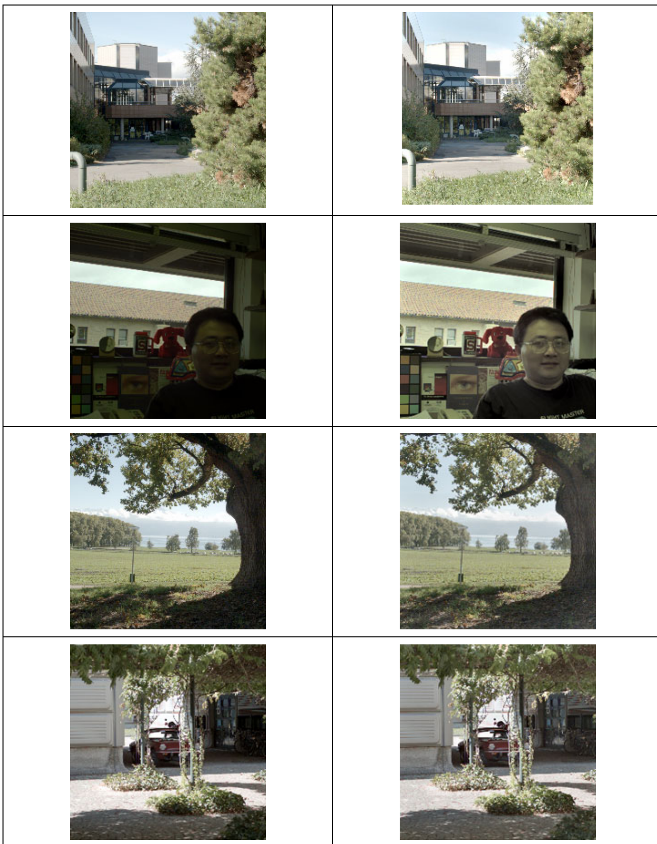
Figure 5. Left: Log-encoded image. Right: Treated Image.