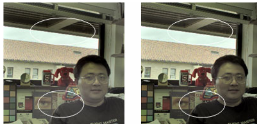
Figure 4. Left: Treated image without varying \sigma . Right: Image treated with our method. The varying \sigma prevents the black T-shirt from becoming gray. It also keeps the areas surrounding the window from becoming too dark.

luminance channel. A processing of the chrominance is still to be introduced.