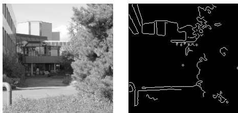
Figure 3. Left: Log-encoded image. Right: "Canny" edge detection.

where \sigma is the Gaussian spatial constant that varies along the radial direction. In this way, the filter's support approximately follows the image's high contrast edges. These edges are detected using the Canny algorithm. 2 The Canny method finds edges by looking for global maxima of the image's gradient. It detects strong and weak edges. Weak edges appear in the output only if they are connected to strong edges. Figure 3 shows the results of a "Canny" edge detection on a log-encoded image.