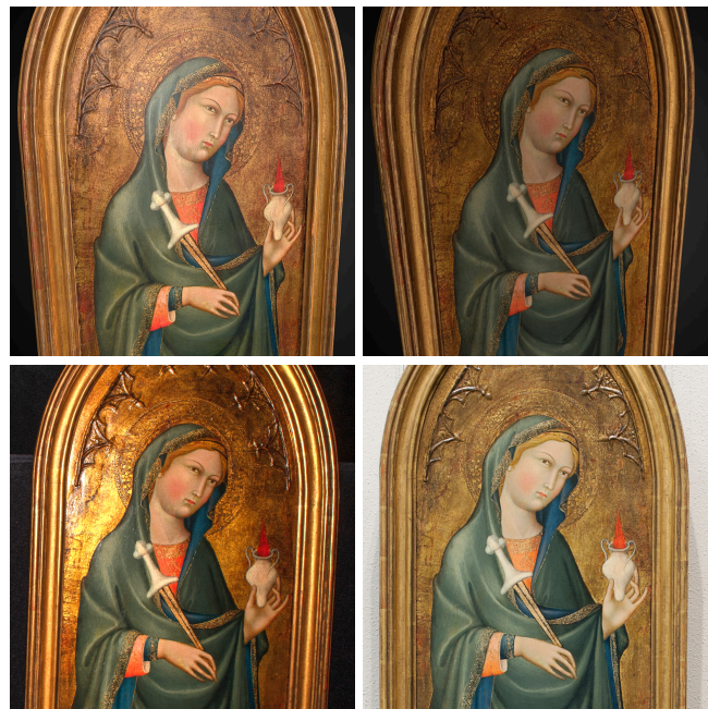
Figure 2. Saint Lucy, by Benedetto di Bindo Zoppo, from the Minneapolis Institute of Art (68.89), processed from 375 photographs. Top left: rendering in Sketchfab using textures from Kintsugi 3D. Top right: rendering in Sketchfab using texture from Metashape. Bottom left: source photograph taken with flash-on-camera. Bottom right: catalog photograph for reference.

The final step is to configure and run a specular fit to generate the specular model and texture maps, using algorithms outlined in prior work [3, 4]. The user may specify the texture size, with texture resolutions as high as at least 8192 x 8192 supported. For objects