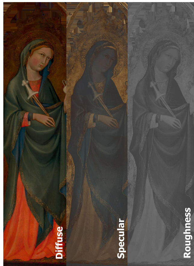
Figure 1. A cropped visual juxtaposition of several generated texture maps of "Saint Lucy," by Benedetto di Bindo Zoppo, from the Minneapolis Institute of Art (68.89). These textures were created in Kintsugi 3D Builder from 375 photographs.

We present a software-based solution, featuring a new free and open source platform called Kintsugi 3D 2 . Developed by a team at the University of Wisconsin – Stout with support from the Minneapolis Institute of Art (Mia) and Cultural Heritage Imaging (CHI) under a grant from the National Endowment for the Humanities (NEH), Kintsugi 3D is capable of synthesizing empirically-based roughness, specularity, normal, and diffuse textures (Figure 1) from an image set containing photographs of an object captured with flash-on-camera illumination. Kintsugi 3D is an evolution of its predecessor, IBRelight [1], with a user experience redesigned to specifically target the application of building textures and materials for use in lightweight 3D viewer applications. What sets Kintsugi 3D apart from other workflows that produce specular maps is that all the textures produced are