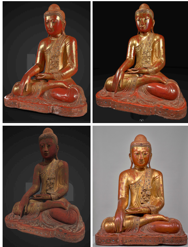
Figure 4. "Enshrined Buddha" from the Minneapolis Institute of Art (89.55), processed from 222 photographs. Top left: rendering in the Sketchfab web viewer using specular textures generated from Kintsugi 3D Builder . Top right: rendering in Kintsugi 3D Viewer . Bottom left: rendering in the Sketchfab 3D web viewer using a color texture generated by Agisoft Metashape . Bottom right: a catalog photo of the object for reference.

brighter and more desaturated than the object's true diffuse albedo, while the textures produced by Kintsugi 3D do not have this issue. In addition, Kintsugi 3D 's use of the ColorChecker chart ensures that the color values in the texture map are normalized to match the object's real-world reflectance. In this sense, the ColorChecker serves in a role for calibrating material appearance similar to what the use of scale bars in a photogrammetry workflow provides for calibrating scale.