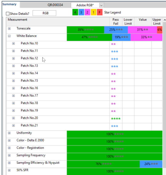
Fig. 1 – Color bar graphic for RGB performance reporting

The use of the word color implies human vision. So, the best approach for any of the visible-range energy-related performance tolerances (e.g., tone scale, noise, white balance) should be human-vision related, i.e. colorimetric, rather than camera/scanner related, RGB. While the two can be related through color-space and ICC profile transformations, the fundamental approach should be colorimetric. This approach was not emphasized in the initial version of FADGI because most users at that time were only familiar with RGB data. L^*a^*b^* colorimetry was not part of the larger community's vocabulary or practice. With a decade of exposure to colorimetric evaluation though, this change should begin. Recall, that \Delta E_{2000} was always reported in the original RGB evaluations.