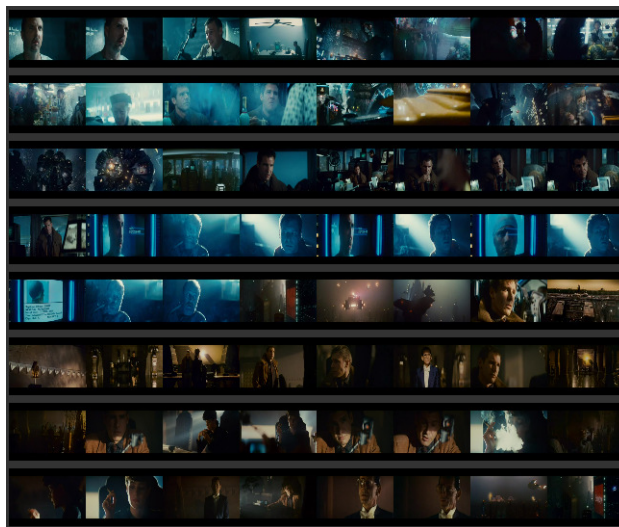
Figure 3. Extract of Ridley Scott’s Blade Runner , Final Cut 2007. 16 minutes of the film (00:06:15-00:22:00).

But we can do it also in the other direction: If we do not have a subtitle file, we will be able to create one. Here we developed a transcription editor like “transcriber” (see Video Transcription ). On the top of the editor you will find the movie player. The movie is controllable over the control bar or with intuitive key combinations. On this way it is possible to watch and control the movie while you are writing – the fingers can stay on the keyboard.