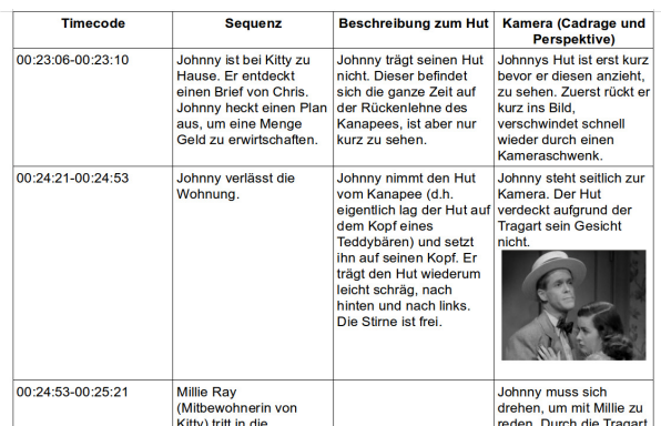
Figure 1. Extract of a simple Motion Picture Sequence Protocol.

Only with the introduction of magnetic tape recording (videocassette recorder – VCR) film analysis can be carried out effectively [5] [6]. So the researcher can record a television program, he can watch the records – if he would, in slow motion – and he can rewind the tape back to a certain position. In the 1980s some researcher connected the VCR with a computer to generate a cutting log list automatically. 1 These projects were nice experiments for quantitative data collection, but not for qualitative interpretations. However the digital revolution just started at this time. Later it was possible to watch movies in a digitized form also on the computer. Since then we can watch and describe a movie on the same device, which is simpler, but at this time not more comfortable.