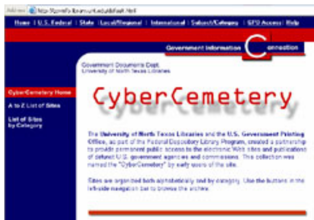
Figure 1. Cybercemetery Project Page

According to the user statistics, most of the sites receive as much or more traffic now than they did when the agency was alive. Popular defunct agency sites available at the Cybercemetery include: the National Partnership for Reinventing Government (the then-Vice president Al Gore initiative, which expired in early 2001 with the change in administrations) and the Office of Technology Assessment, (which closed September 29, 1995, after 23 years of analyzing the public policy implications of scientific and technological innovations). For complete descriptions of the agency sites included, please visit the CyberCemetery at: http://govinfo.library.unt.edu/