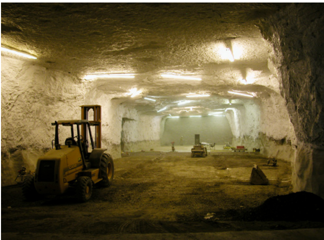
Housed in a former limestone mine that at one time served the Pittsburgh steel industry, new areas in the mine are being cleared for construction of additional records preservation centers.