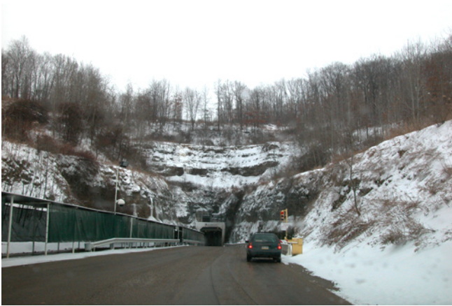
The guarded entrance to the Iron Mountain/National Underground Storage Vital Records facility, located in a secluded area about an hour's drive northeast of Pittsburgh, Pennsylvania.