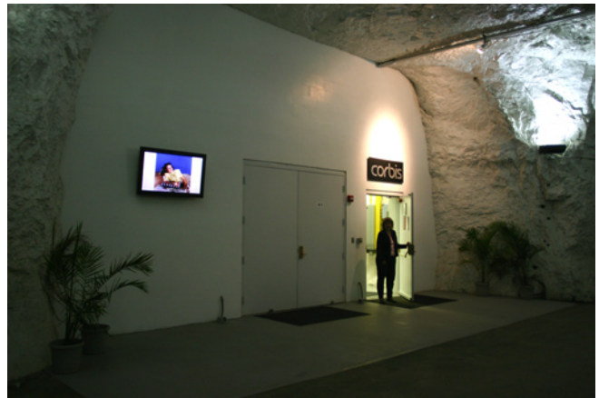
With an LCD video display showing photographs from the Corbis collection, the entrance to the Corbis Film Preservation Facility has a somewhat otherworldly appearance when one first encounters it deep within the underground limestone mine.