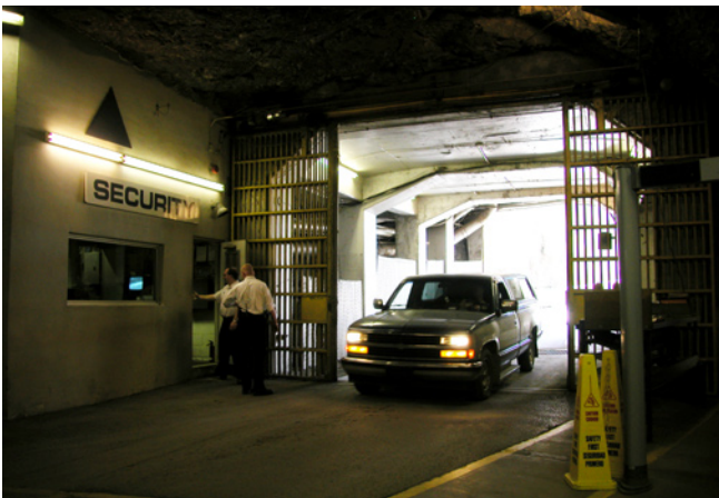
The home to a large number of paper-based, film-based, and digital records centers serving the U.S. government, business, and Hollywood motion picture industry, armed guards and electronic surveillance systems provide security 24 hours a day.